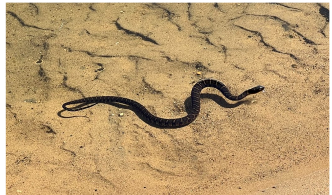
A HARMLESS Northern Brown water snake near shore in September 2022, No need to worry!