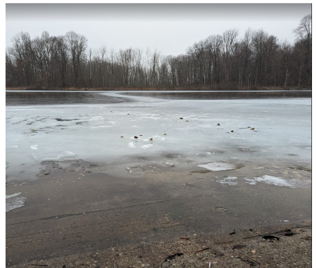
We had a light winter this picture was taken from the boat launch, looks as if the ice was making a pathway.